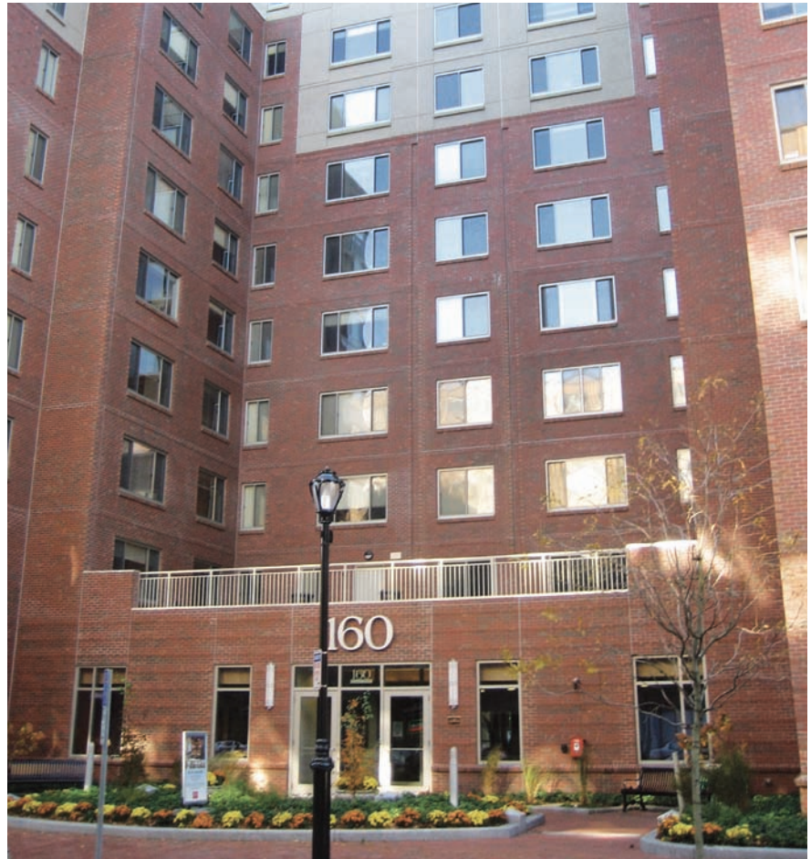
Abbot Building Restoration removed and replaced weatherproofing sealant at the Pleasant Street Apartments in Malden, Mass.

Upon receiving the revised project specifications, each candidate contractor performs a “takeoff” on the plans. This includes a comprehensive review of the drawings and specifications, and one or more onsite visits to the property. The contractor performs his own field measurements to verify the accuracy of the measurements and quantities outlined in the plan.